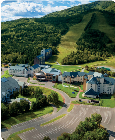
All-inclusive Stay at Club Med

*Special price applicable for this package only | Tour services are provided by C.P. Holiday Co., Ltd.