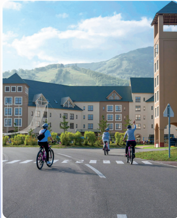
Resort Activities Included

*Subject to change due to weather conditions