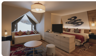
Deluxe Size: 57-69 sqm Occupancy: 3-4 pax