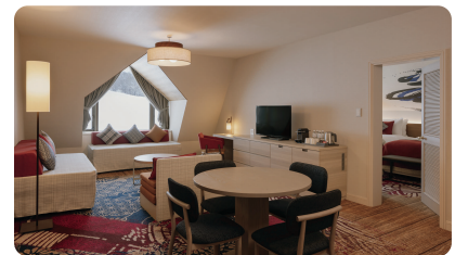
Suite Size: 77-96 sqm Occupancy: 5 pax