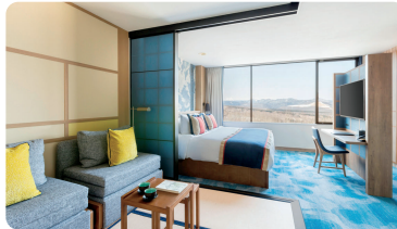
Deluxe Size: 29-37 sqm Occupancy: 2-5 pax