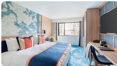
Superior Size: 27 sqm Occupancy: 2-3 pax

Standard Amenities For All Accommodation: Minibar, Coffee & Tea kit, Wi-Fi access, Hair dryer, Umbrella, Security safe, Japanese electrical sockets (100-127 volts), Ironing kit