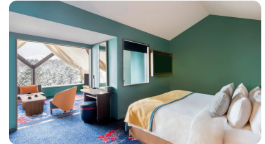
Suite Size: 55-72 sqm Occupancy: 5 pax