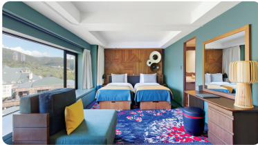
Superior Size: 38-71 sqm Occupancy: 2-5 pax

Standard Amenities For All Accommodation: Wi-Fi access, Air-conditioning / Heating system, Coffee & Tea kit, Umbrella, Security safe, Japanese electrical sockets (100-127 volts), Hair dryer, Ironing kit, Magnifying mirror