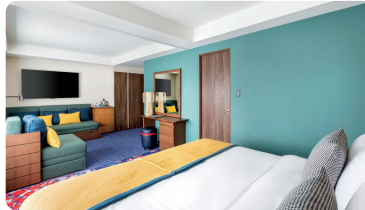
Deluxe Size: 38 sqm Occupancy: 2-3 pax