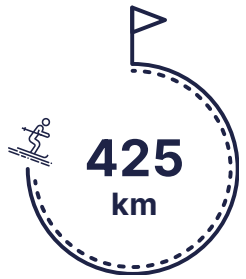
Alpine ski slopes