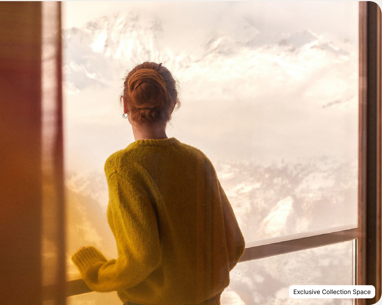
Exclusive Collection Space